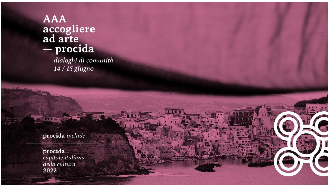
Procida, capitale della cultura italiana 2022