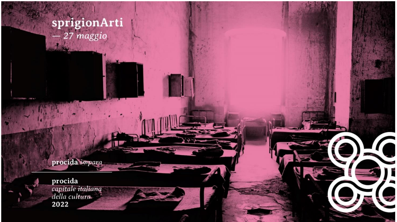
Procida, capitale della cultura italiana 2022