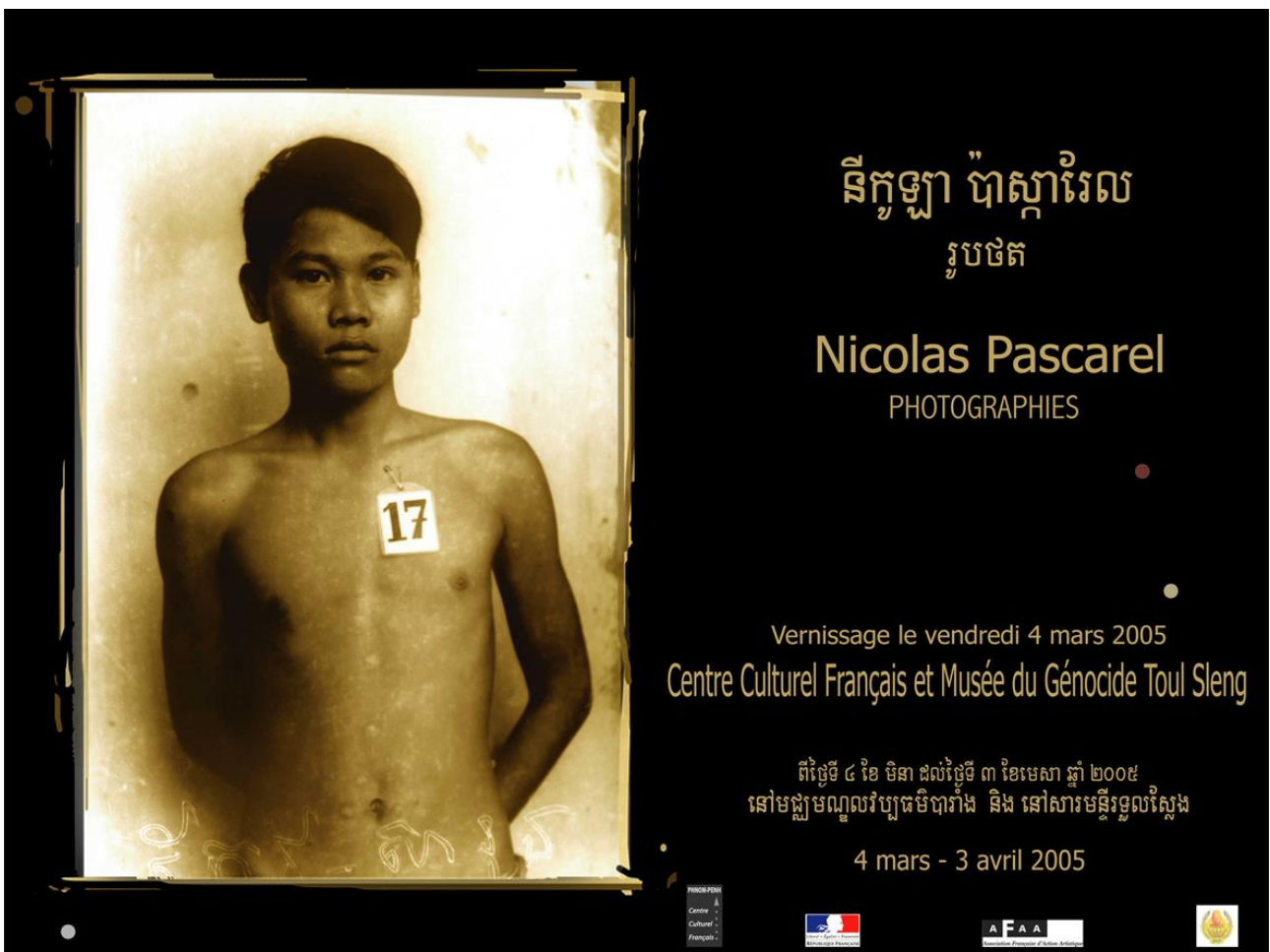
Tuol Sleng S21 Genocide Museum, Phnom Penh Cambodia 2005