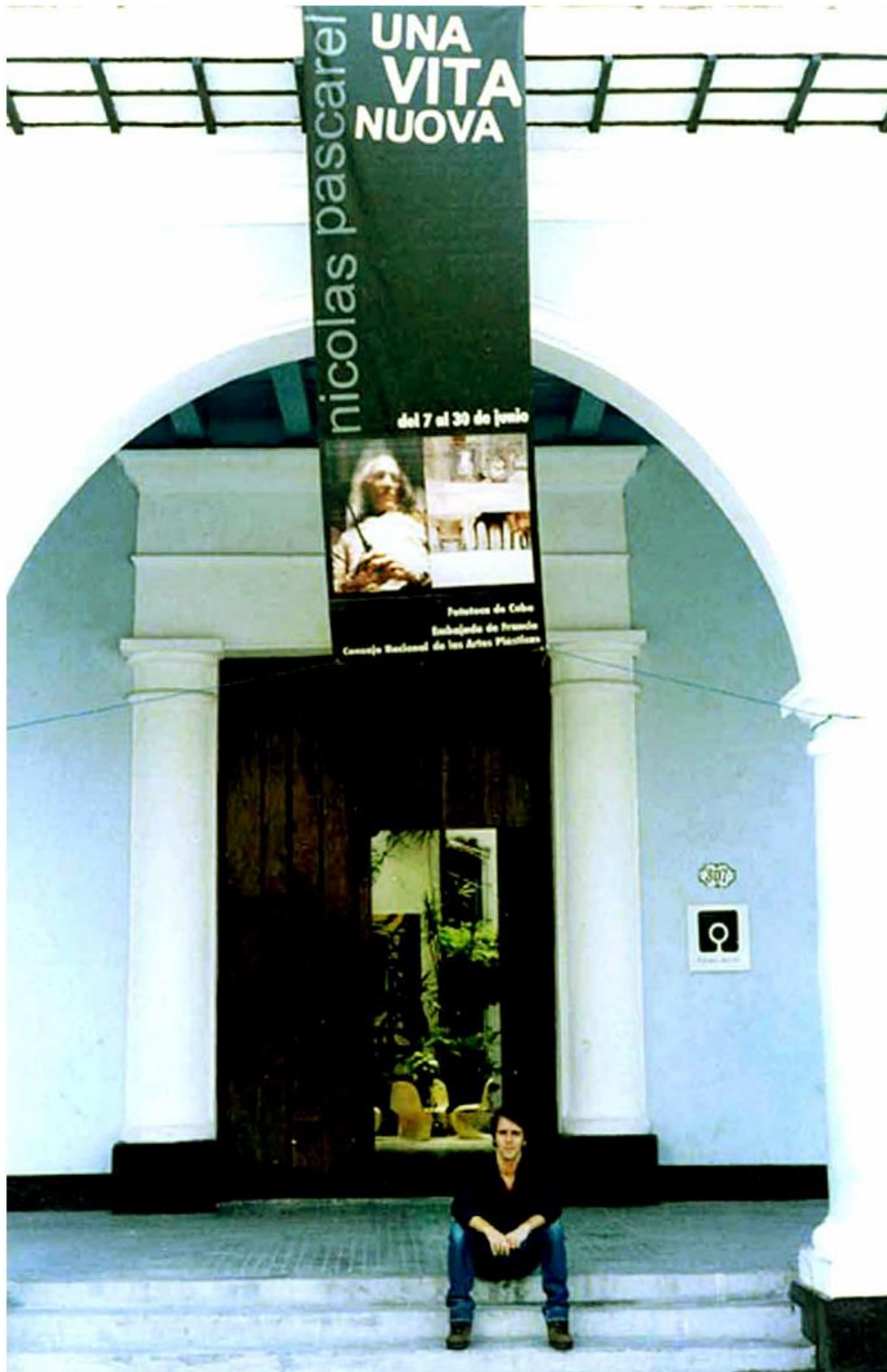
Fototeca de Cuba 1999 and 2001 "Una Vita Nuova" and "Moros y Cristianos"