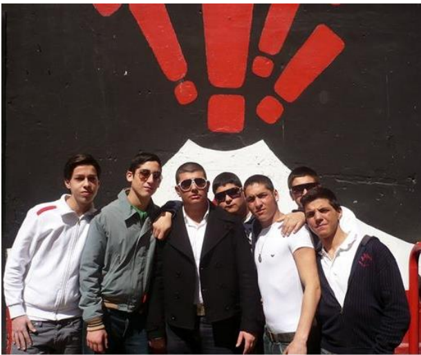
Gruppo fotografico, 2008 30 x 24,83 cm.