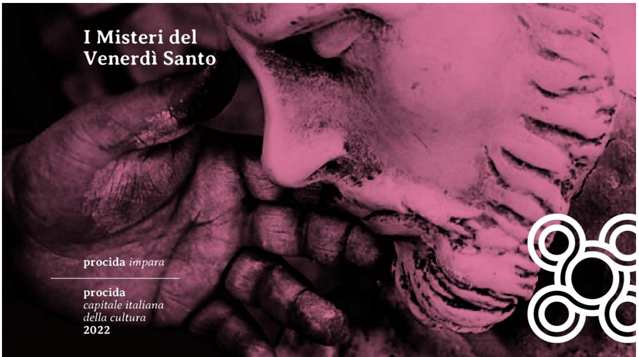
Procida, capitale della cultura italiana 2022